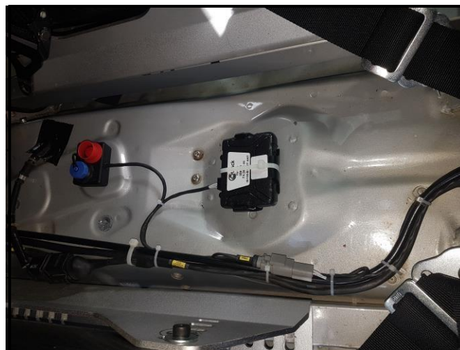
Routing the Harness

Route the harness to the vehicle's battery by following the existing harness in the vehicle and secure by means of cable ties. Make every attempt to steer clear of any communication wire to avoid interference from the tracking unit.