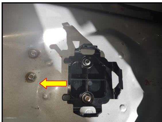
Ctrack Bracket Position

In cases where the surfaces where brackets are mounted get extremely HOT add more washers in order to raise the unit's bracket further from the vehicle's body.