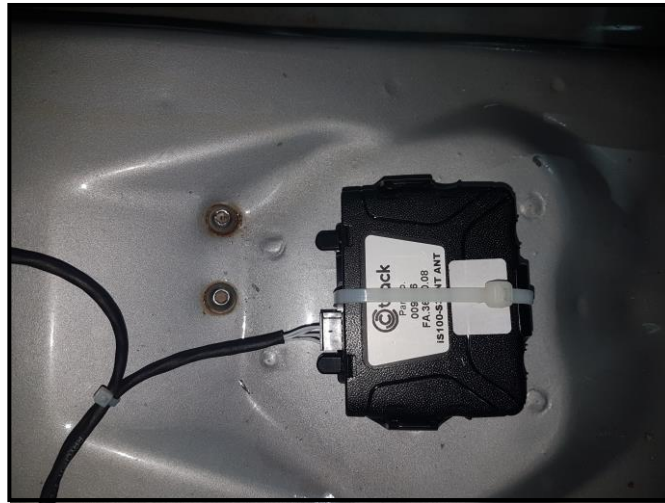
Securing the Ctrack Unit

Push a 300mm cable tie between the vehicle's body and the mounting bracket, clip the unit into the bracket and secure with the cable tie.