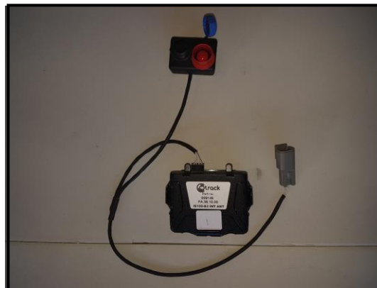
Panic Button Assembly & Ctrack Unit

CAUTION: The panic button is allowed to be used for MEDICAL EMERGENCIES ONLY