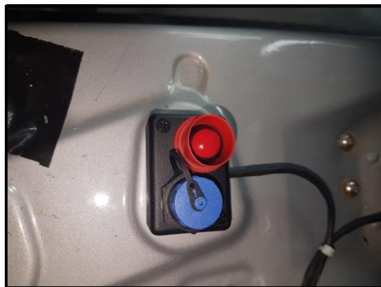
Mounting the Panic Button

The Panic Button may only be used in case of a Medical Emergency