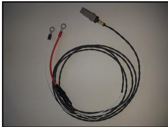
Plug & Play harness

The following equipment will be supplied in the installation kit: