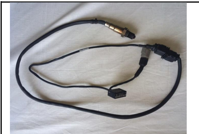
5) Lambda harness.