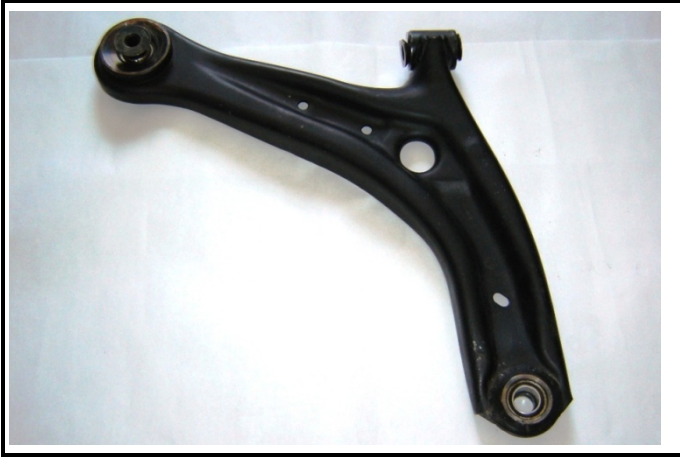
3) Reinf wishbone, fr susp, type 3. Top.