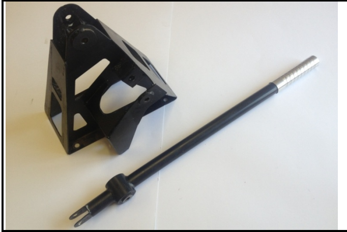
3) Hand brake assy, type 2 - dismounted